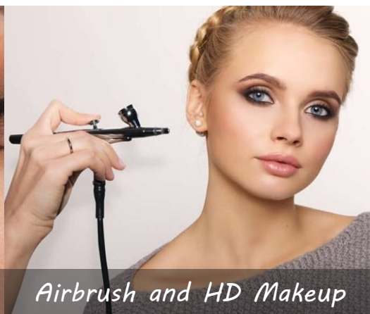
Airbrush and HD Makeup