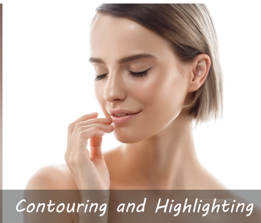
Contouring and Highlighting