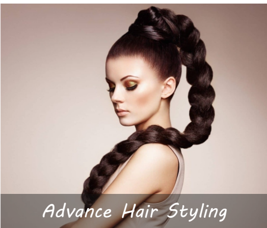
Advance Hair Styling

Advance Hair Styling Bridal HD Bridal Airbrush Basic And Advanced Party Makeup Different Types Draping